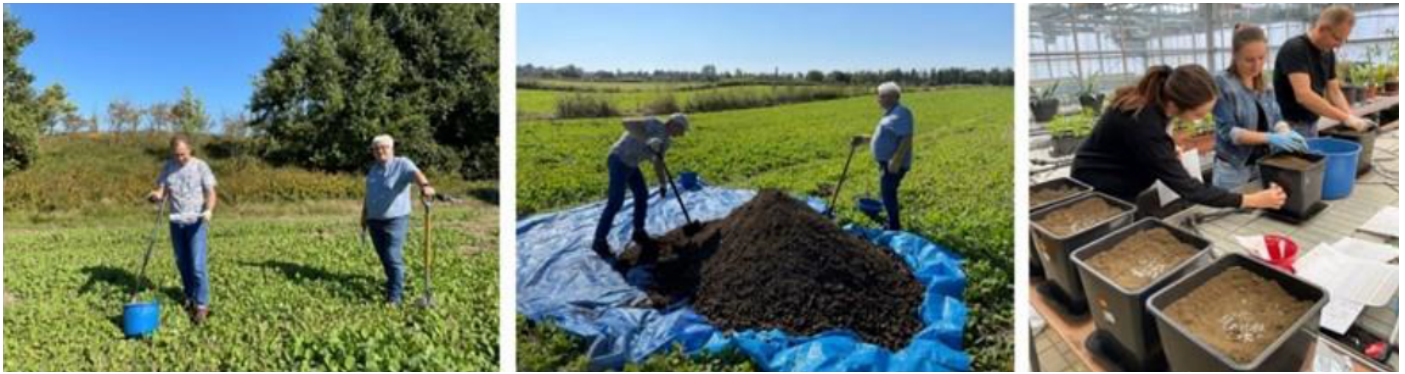
Figure 1: UMCS, Poland, collecting soil for pot trials.

hydrolysates, fulvic/humic acids, or protein hydrolysates combined with mycorrhiza. Optimisation of plant growth combined with enhanced metal accumulation in shoots and/or organic pollutants degradation will allow to produce high feedstock quantities for biofuel production on polluted lands (ensuring low ILUC effects), while contributing to the remediation of the soil.