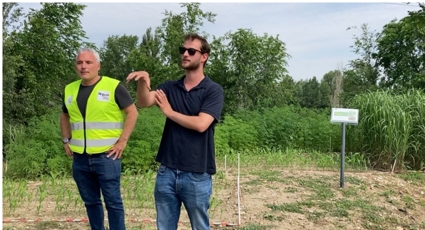
Figure 6: Webinar Speakers

Results from the first year have noted a very slight improvement in soil properties in respect to the baseline samples, but not significant. This year, like last year, will include application of soil amendments, as well as chemical anti-weed agents. It is foreseen that the trails will follow the same growing pattern as last year with the harvesting period commencing in autumn 2023, after which the crops and soils will be analysed both for any improvements in soil quality and production of biomass.