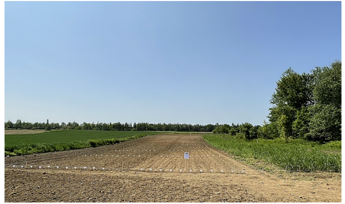
Figure 4.3: Sorghum, hemp, and miscanthus at Dołki, in the Upper Silesia Industrial Region, southern Poland