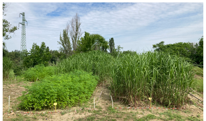
Figure 4.2: Established crops at Chiarini 2 site, Bologna, Italy