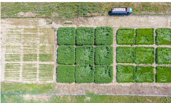
Figure 4.1: Aerial view of crop established in Prosilio site, Western Macedonia, Greece

The second year field trials began with the sowing of crops in early spring 2023. The following photos show the progress of crop establishment in June 2023 at some of the European sites.