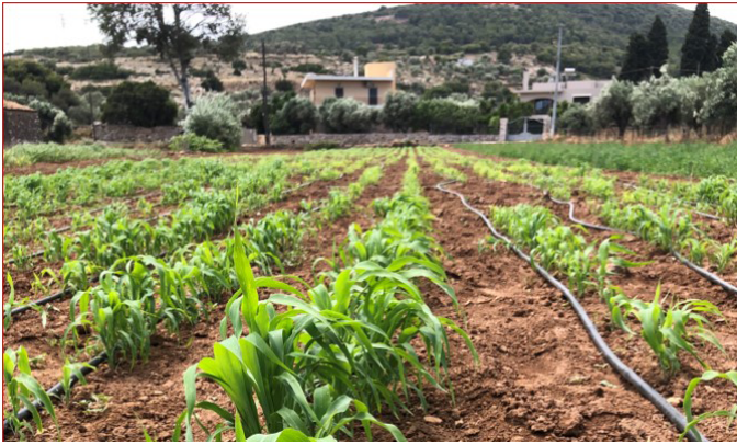
Figure 4.3: Established Sorghum crops at Thorikon, Lavreotiki peninsula, Greece